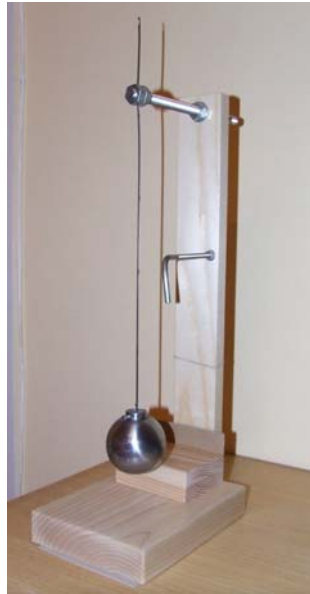
Picture 3. Promotion of new prototype of an educational toy or teaching aid (proof that over unity exists) is being prepared

As there already are many researches based on pendulum drive, it is necessary to spread this information because gravitation is available for everyone and inexhaustible. Previous achievements and inventions in this field should not be taken as final since currently thousands of researchers from all over the world are taking part in researches and improvements.